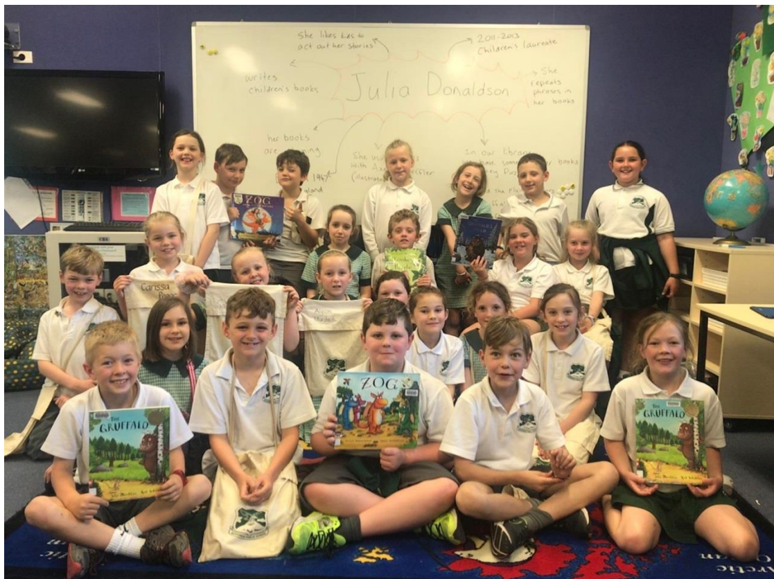
3/2W with their library bags and Julia Donaldson's books ready for their author study.

All classes have the option to borrow books during their library lessons. Our school is very lucky to have an extensive library collection to choose from. In our fiction section, students have the choice of picture books, junior novels, early chapter books, novels and graphic novels just to mention a few. Students can also borrow from the non-fiction collection on topics that interest them such as cars, horses, reptiles, kids cook books, drawing books, dinosaurs, pets and lots more. Please encourage your child to take advantage of this and borrow books on their library days. They do need a library bag to borrow. This is to keep our books safe so that they are there for students to borrow for years to come.