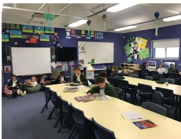
Year 3 students from 3/2W hard at work on their PRC

Students have continued to make steady progress in the PRC this term. Many students in years 3-6 have completed their challenge, with many more soon to follow. We are looking forward to handing out those certificates at the end of the year.